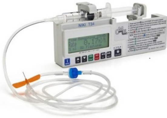
Figure 2 A Mckinley T34 pump of the type often used for continuous subcutaneous infusions in the community.

This is then divided by two to convert to an equivalent subcutaneous dose of 25 mg per 24 hours by continuous infusion.